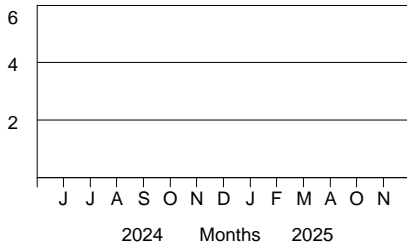
kWh - Average Per Day