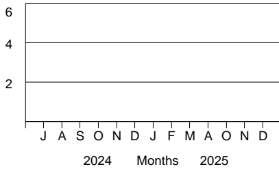
kWh - Average Per Day